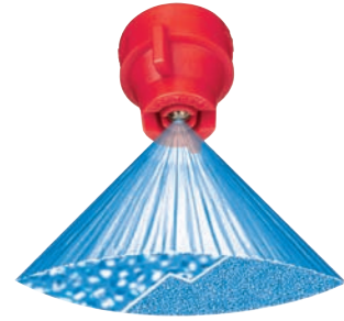
At 15 PSI (1 bar) Pressure