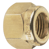
CP20230 TeeJet Cap

*Use CP20229-NY gasket when 4514-NY Nylon slotted strainer is not used.